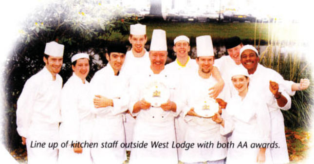
Line up of kitchen staff outside West Lodge with both AA awards.