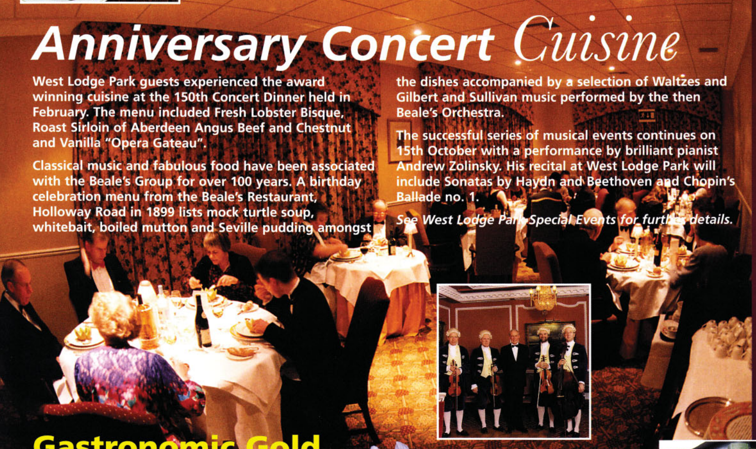
Guests in Cedar Restaurant for 150th concert dinner

See West Lodge Park Special Events for further details.