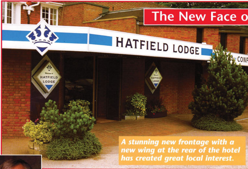
A stunning new frontage with a new wing at the rear of the hotel has created great local interest.

The increase of business in the Hatfield area and the consequent need for local accommodation has resulted in a "new look" Hatfield Lodge.