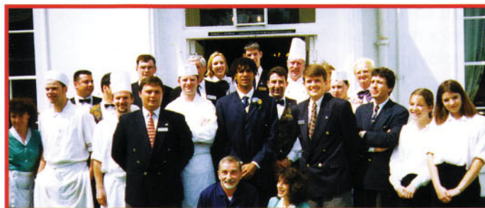
Ruud Gullit, Chelsea Manager, with a group of West Lodge Park staff on Cup Final Day.

Answers in writing please, including your name and address to the Sales Office, West Lodge Park, Cockfosters Road, Hadley Wood, Hertfordshire EN4 0PY, by Friday 5th December 1997.